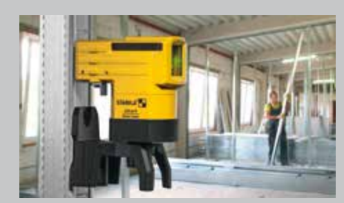
Strong rare-earth magnet system