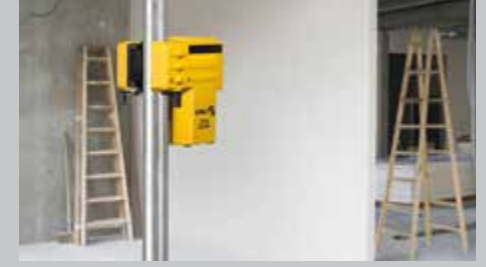
Integrated clamping device